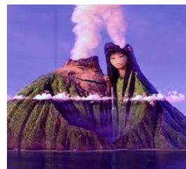
"uku and "Iele"

Intro: C . . . | G7 . . . | F . . . | C . G7 . . .